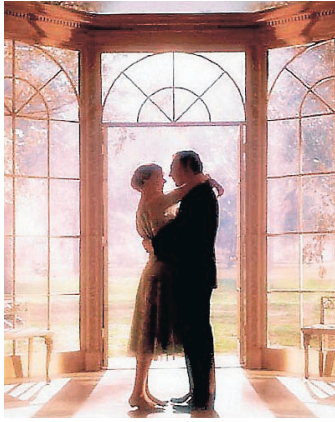
Julie Andrews and Christopher Plummer in the famous gazebo.